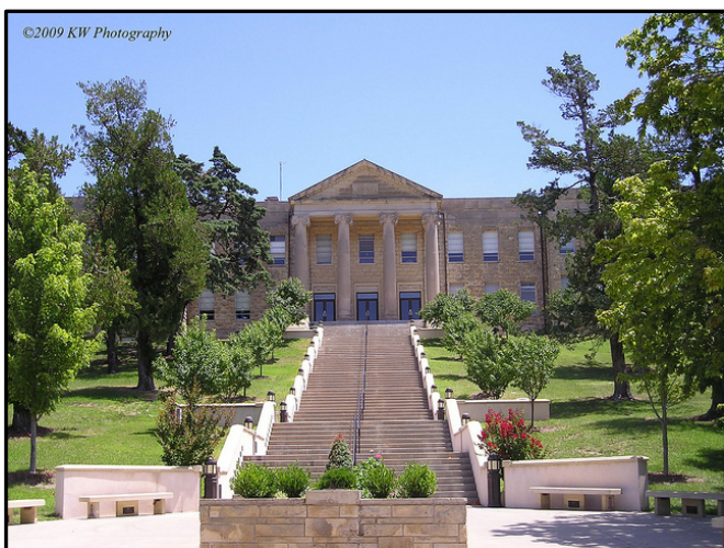
*Southwestern College Residential Campus Winfield, KS

Southwestern is a learning community of approximately 1,800 learners, 50 full-time teaching faculty members, and 270 affiliate faculty members from leading industries across the country. In addition to programs for traditional age learners and working adults, the College provides learning opportunities for service men and women in all branches of the military.