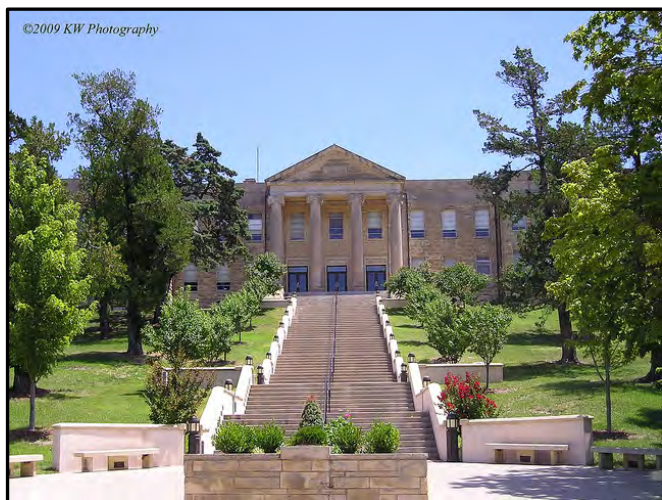
*Southwestern College Residential Campus Winfield, KS

Southwestern is a learning community of approximately 1,800 learners, 50 full-time teaching faculty members, and 270 affiliate faculty members from leading industries across the country. In addition to programs for traditional age learners and working adults, the College provides learning opportunities for service men and women in all branches of the military.