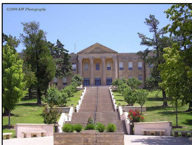
* Southwestern College Residential Campus Winfield, KS

Southwestern is a learning community of approximately 1,800 learners, 50 full-time teaching faculty members, and 270 affiliate faculty members from leading industries across the country. In addition to programs for traditional age learners and working adults, the College provides learning opportunities for service men and women in all branches of the military.